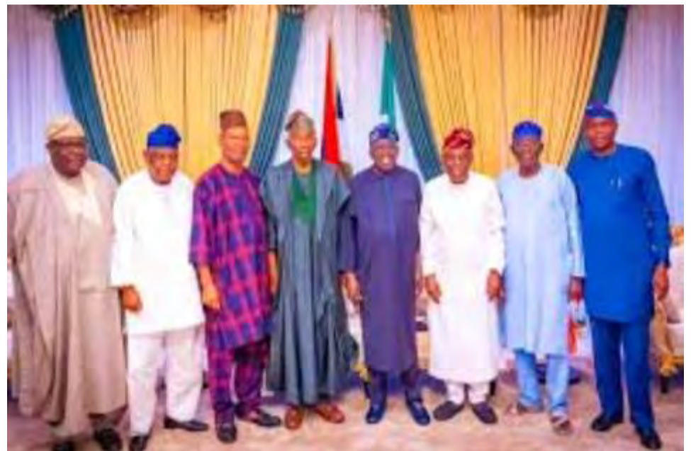
GAC members with President Tinubu