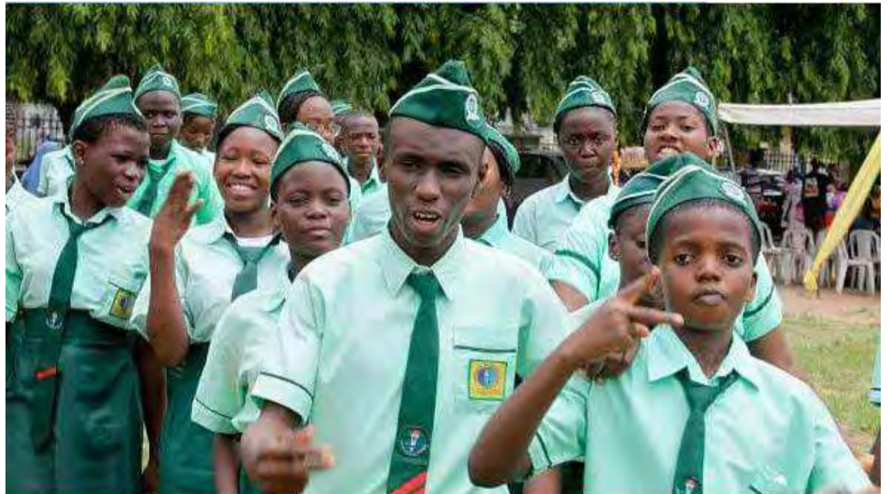
Cross section of secondary school students