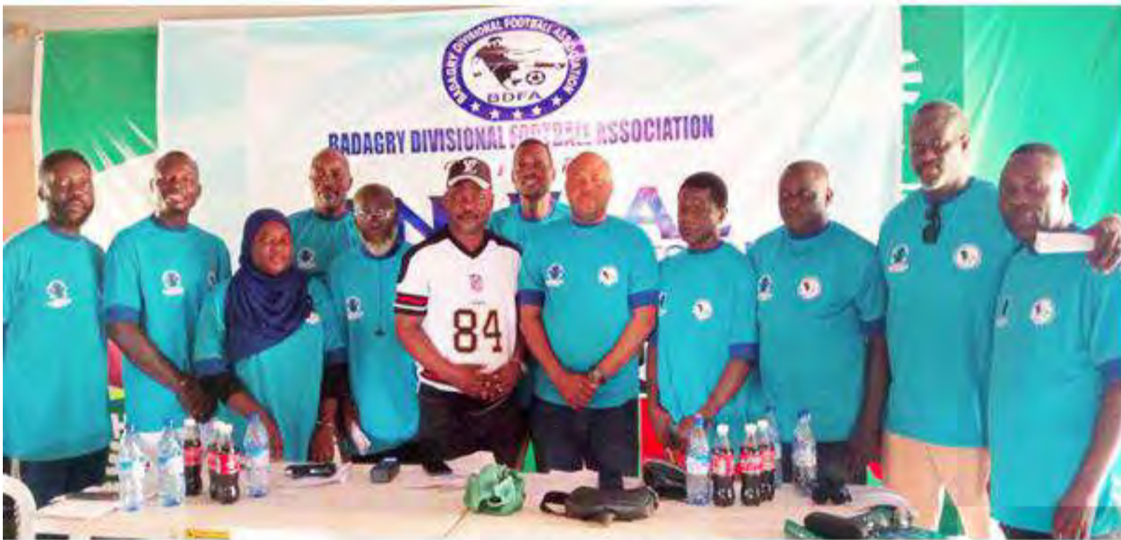
Badagry Divisional Football Association congress members in a group photograph